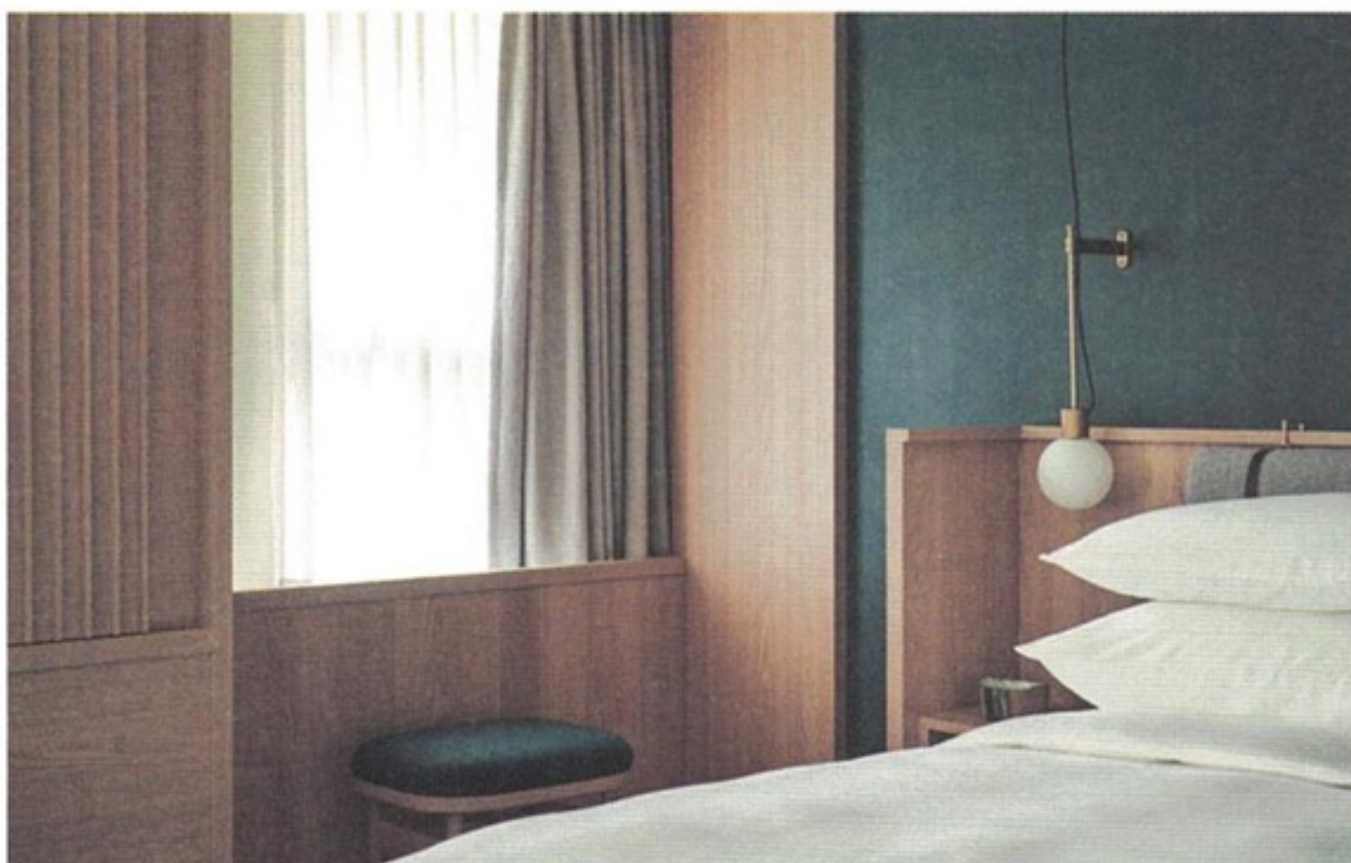
The Stratford — London

Danish design studio Space Copenhagen brings its brand of Nordic cool to The Stratford, a luxury hotel occupying the first seven floors of a new skyscraper in East London's up-and-coming cultural area of Queen Elizabeth Olympic Park. While the hotel itself celebrates timeless glamour and New York's legendary Chelsea hotel in the 1950s, the double-cantilevered building provides a futuristic backdrop for Space Copenhagen's design, where natural materials, warm metals and concrete flooring figure prominently alongside bespoke furniture and pieces from the studio's existing portfolio. Two restaurants bookend the property: the ground-floor Stratford Brasserie and the seventh-floor Allegra.