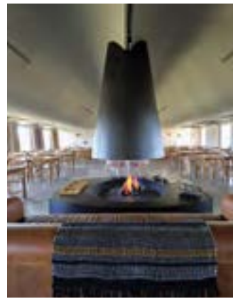
From left: Craveiral Farmhouse's low-slung cottages; the restaurant at Craveiral Farmhouse

Pinto discovered the land for his hotel beneath a 9ha field of carnations ( cravo is the Portuguese word for the flower). The 38 suites and cottages are newly built, yet they easily blend in with the old farmhouses of São Teotónio, with their squat chimneys and tiled roofs. Inside, walls of cork and wood provide a modest backdrop for a handful of modern amenities, such as Hästens mattresses, soaking tubs and minimalist furnishings from Portugal's WeWood atelier. The mini-village also has four swimming pools and a wellness centre.