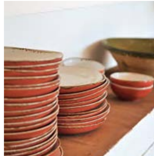
Clockwise from left: ceramics by Vista Alegre in the Herdade da Malhadinha Nova's restaurant; a Casas das Pedras suite; a farm-to-fork lunch in one of the villas