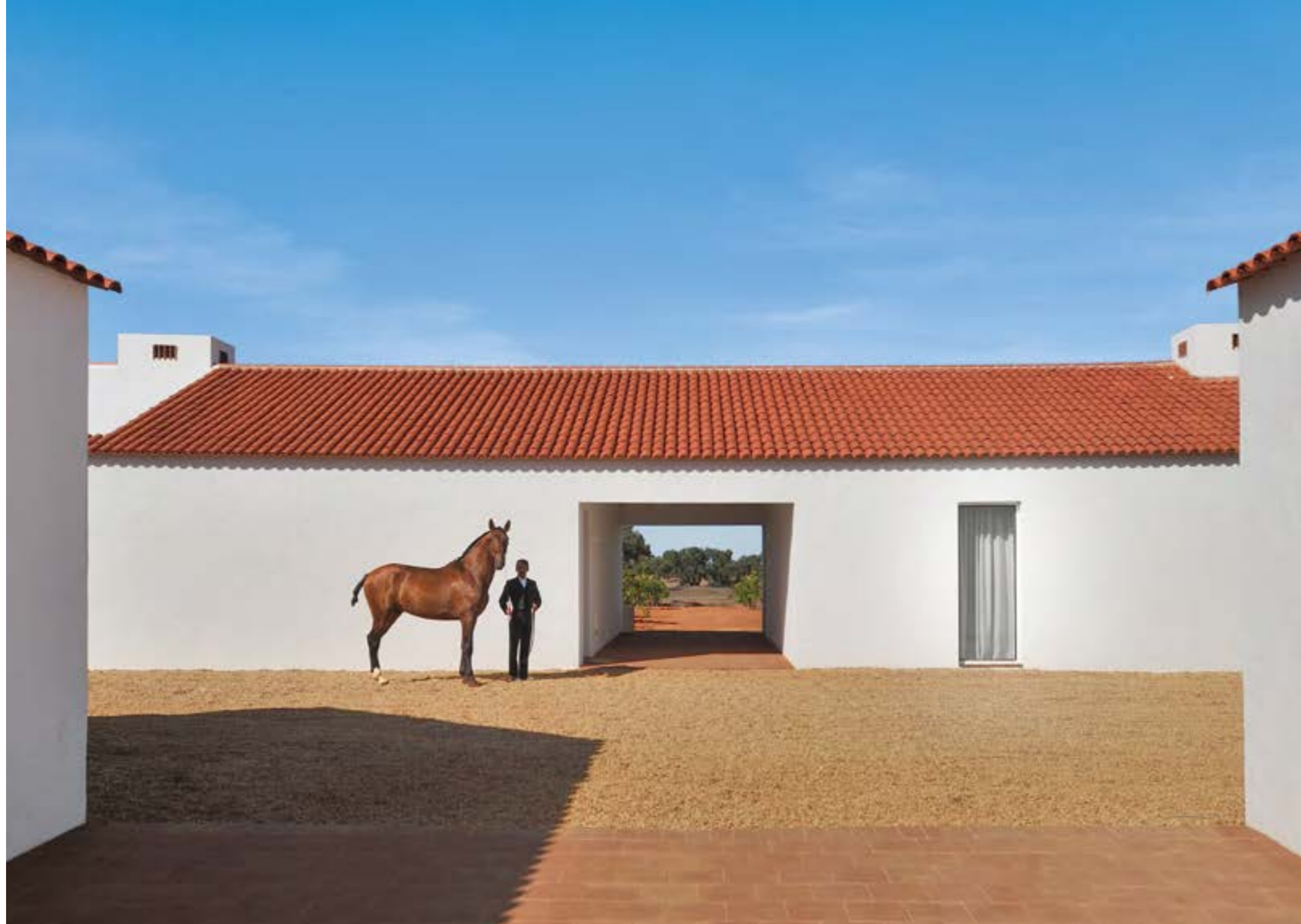
From left: a Lusitano horse at Herdade de Malhadinha Nova; a private place in the sun at Dá Licença