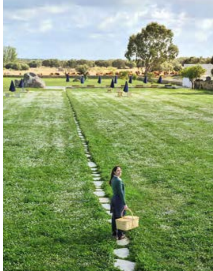
Right: en route to the herb garden and pool at São Lourenço do Barrocal; below: the estate's intimate lounge

careers in Lisbon only to return to their humble homes with a new business plan; others have been built by Portuguese natives who fell in love with the Alentejo's simpler way of life. But despite the addition of sparkling pools, fine-dining restaurants and world-class art collections, there isn't a whiff of pomp to any of them. These rural retreats, spread across small villages throughout the region, are farms first, where cork and wild mushrooms have more status than frequent-flyer miles or Instagram followers. The locals around here, both new and old, know well enough what mass tourism can do – they need only look to the Algarve for examples of what they don't want their home to become – so they instead insist on indulging their guests in Alentejan authenticity. The luxuries are simple: time, space, tradition and a hearty dose of calma .